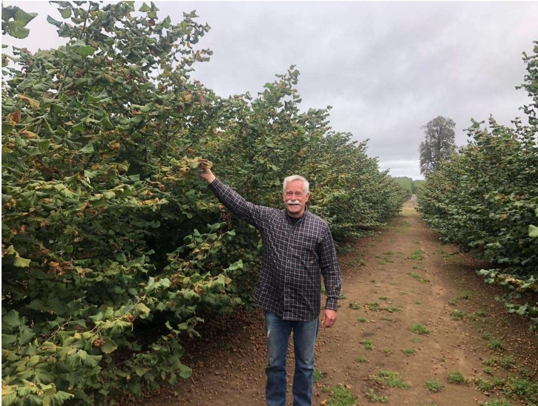
A 'Yamhill' orchard in Osorno, Chile.