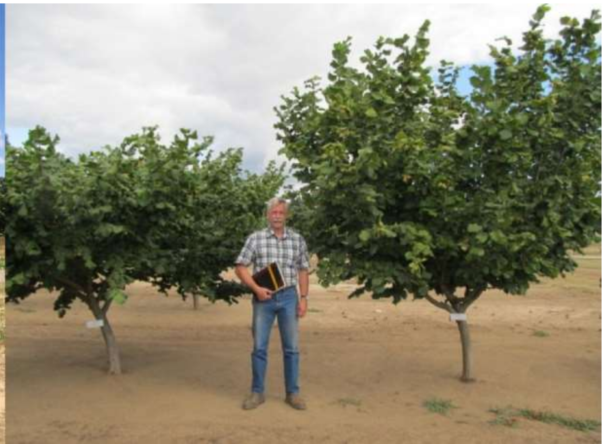
8 th leaf: 'Yamhill' (left) and 'Jefferson' (right).