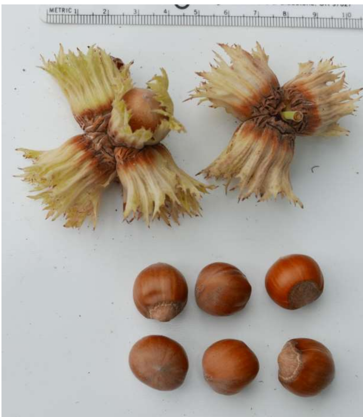
Clusters and nuts of 'PollyO' hazelnut.