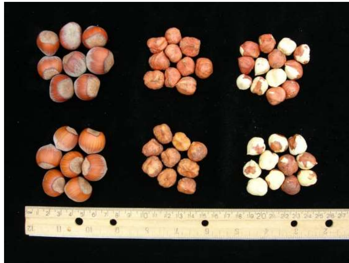
'Barcelona' (top) and 'Jefferson' (bottom)