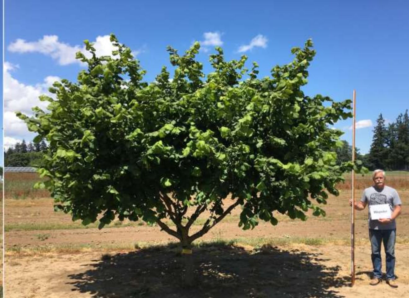
9 th leaf: The 'Wepster' tree canopy opens to allow sunlight penetration. Prune in the "on year" for well-filled nuts.