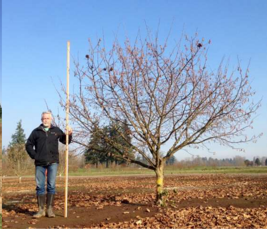
8 th leaf: Tree of 'PollyO' (right) showing globose growth habit.