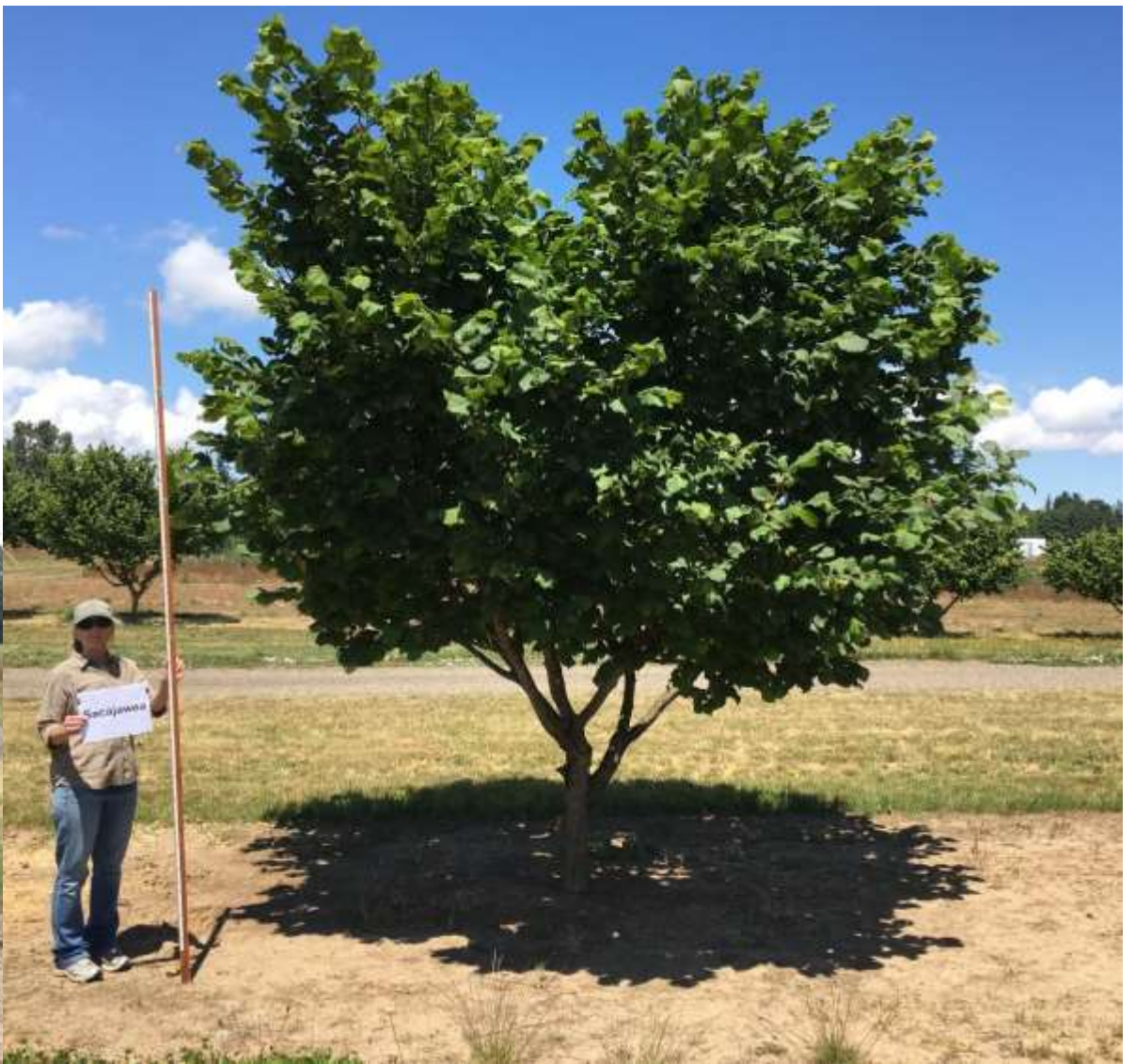
'Sacajawea' (right) has a globose growth habit. Remove some branches to allow sunlight penetration.