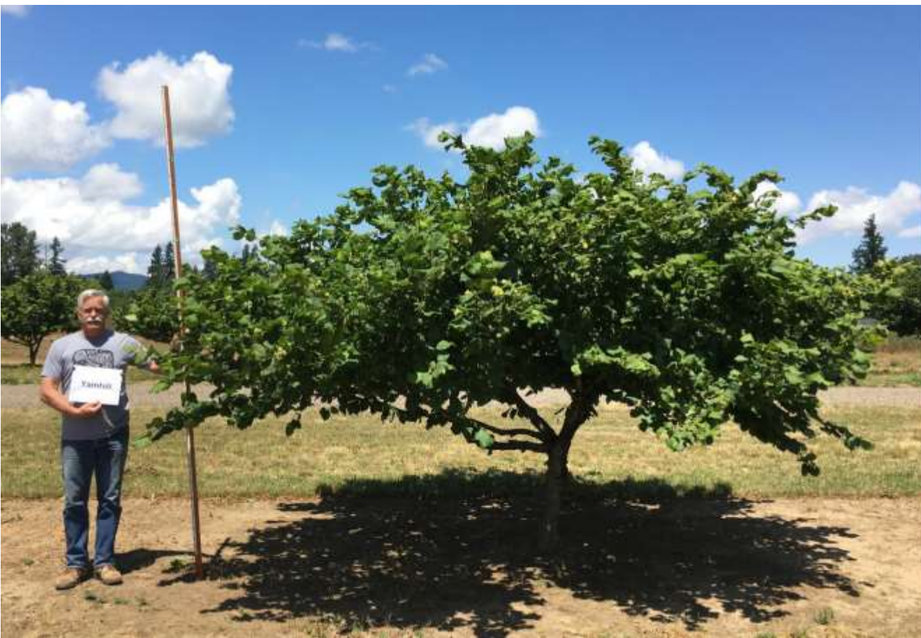
11 th leaf: The low vigor and spreading growth habit of 'Yamhill' (left).