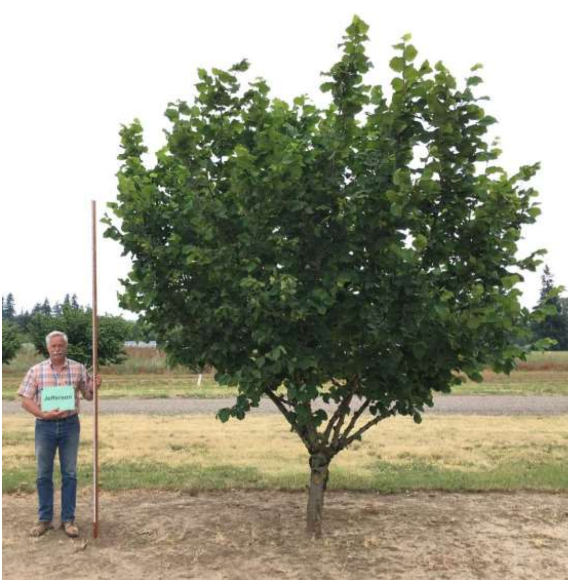
Trees in their 11 th leaf. 'Jefferson' (left) upright growth habit.