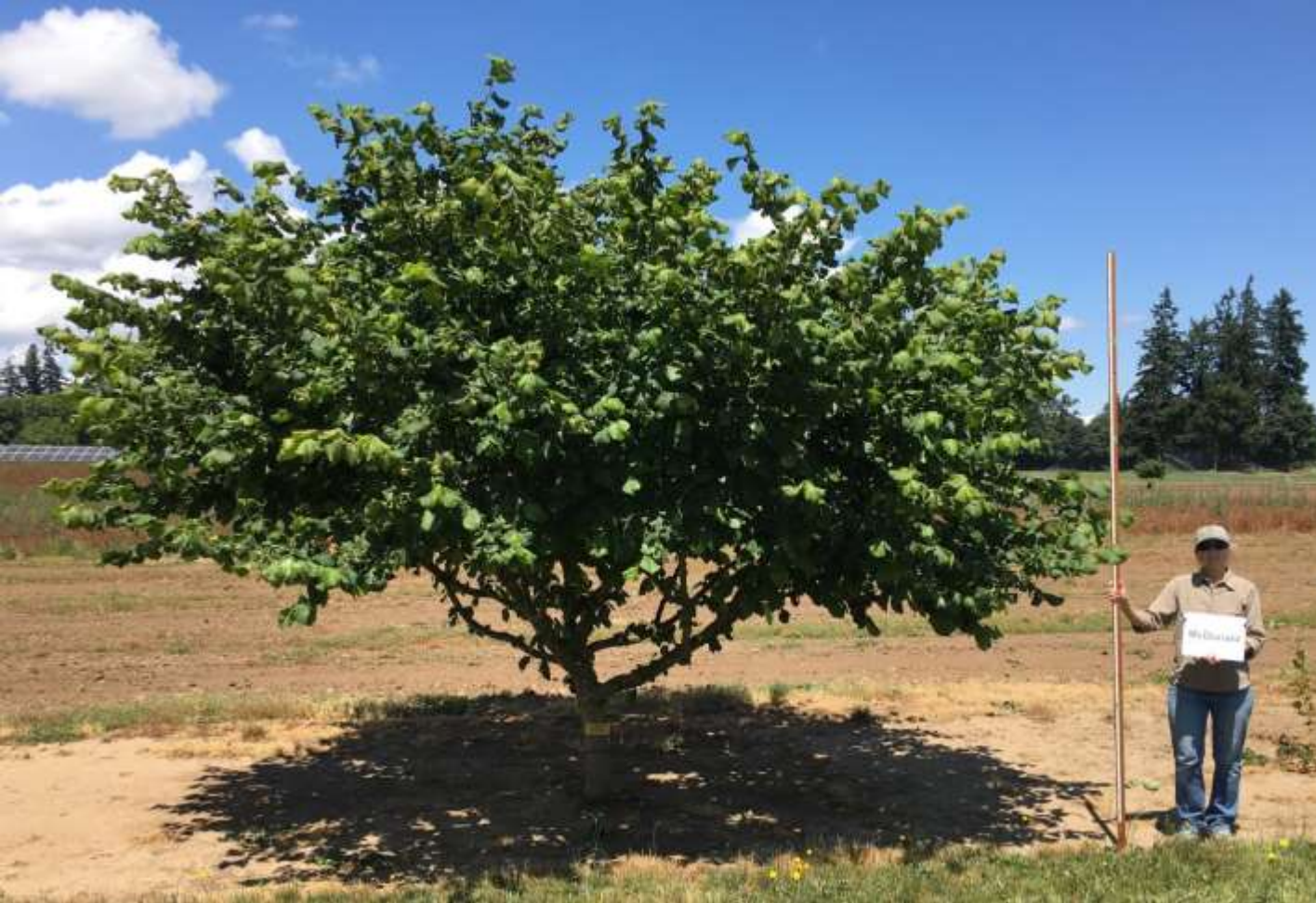
9 th leaf: Tree of 'McDonald' (left) with open canopy for sunlight penetration.