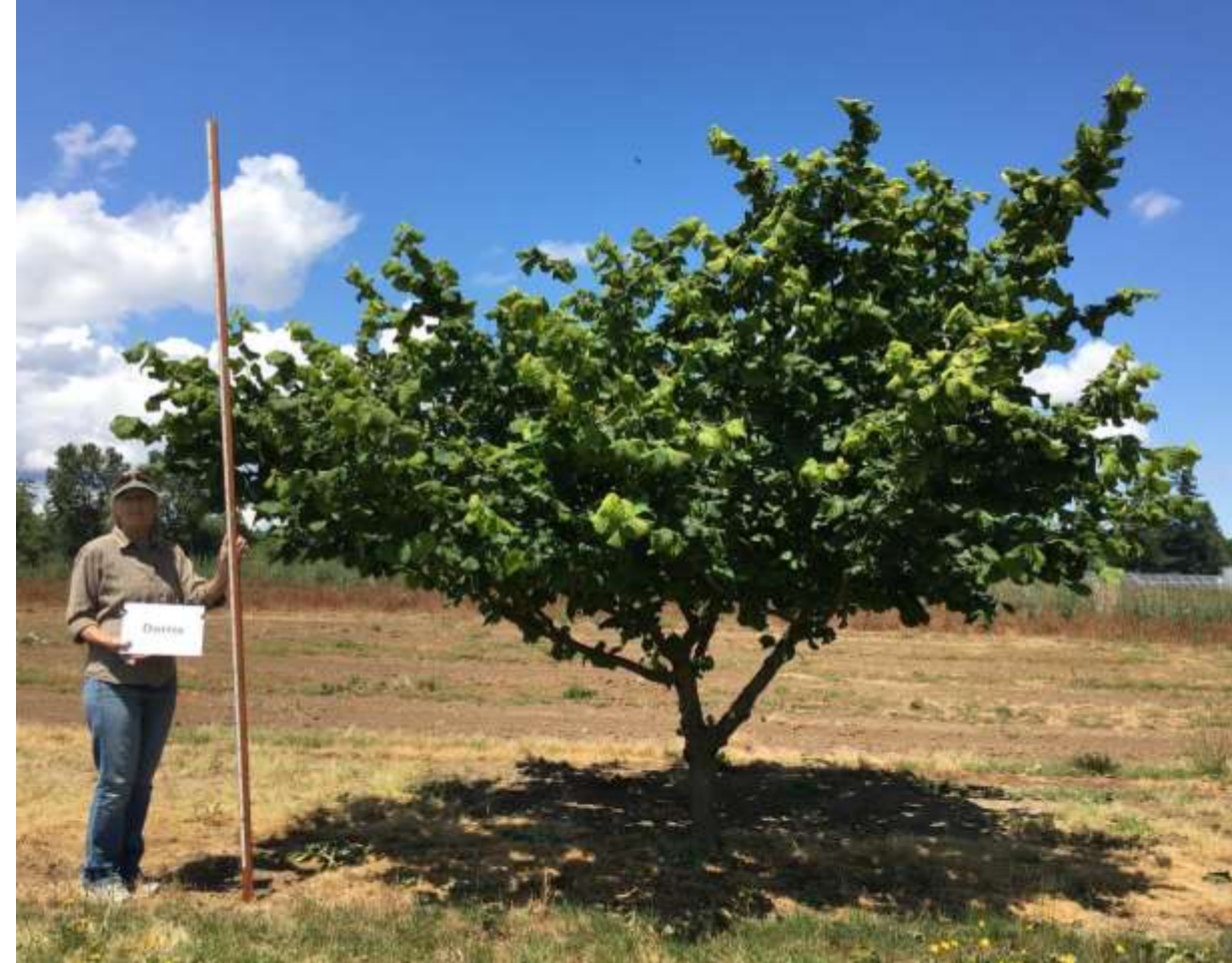
9 th leaf: 'Dorris' (left) has a low-vigor tree. 'Dorris' is performing well in Chile. Suitable for high density.